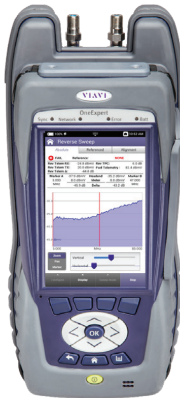
ONX with return sweep

Many operators are simply out of space in the hubs and cannot do traditional node splits. Remote PHY gets rid of the analogue fibre going out to the node, so the link is more robust and easier to maintain. Operators can service the higher modulation schemes available with OFDM,