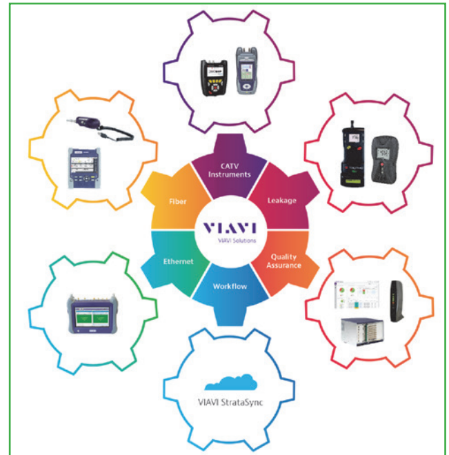
Complete DAA-ready portfolio

With Remote PHY, a lot of people want to take the CCAP further back into the network and have it in the head-end or the data centre, rather than in the hub. That is the direction in which Remote PHY is going, which may require more timing tests.