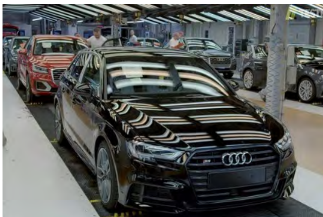
Audi is one of the first companies to experiment with industrial 5G.