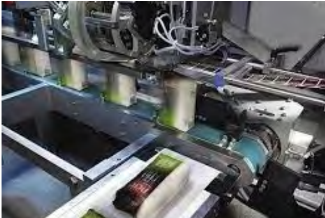
Bosch is a leader in factory automation.

End users of 5G industrial automation solutions are the big prize for the companies that are investing in and testing these new technologies. But so far, none of them have launched live production lines using 5G. Even at Bosch's own factories, the 5G trials run parallel to the live production lines, but are not responsible for actual manufactured deliverables.